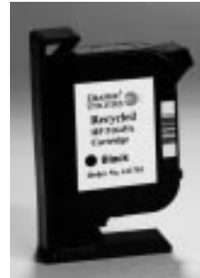
Style HP 51640/41/45

Don't throw those old ink jet cartridges away!