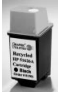
Style HP 51626/29A